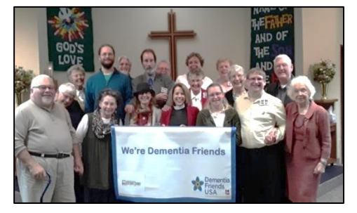
Holy Faith Church