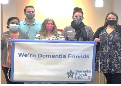
Old National Bank