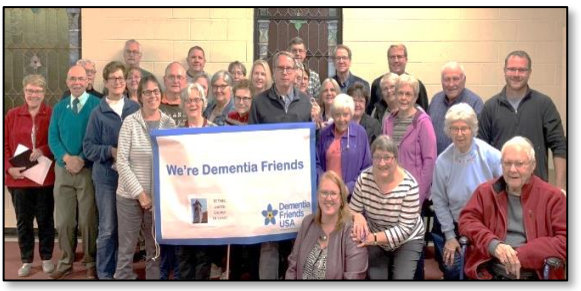
Bethel United Church of Christ